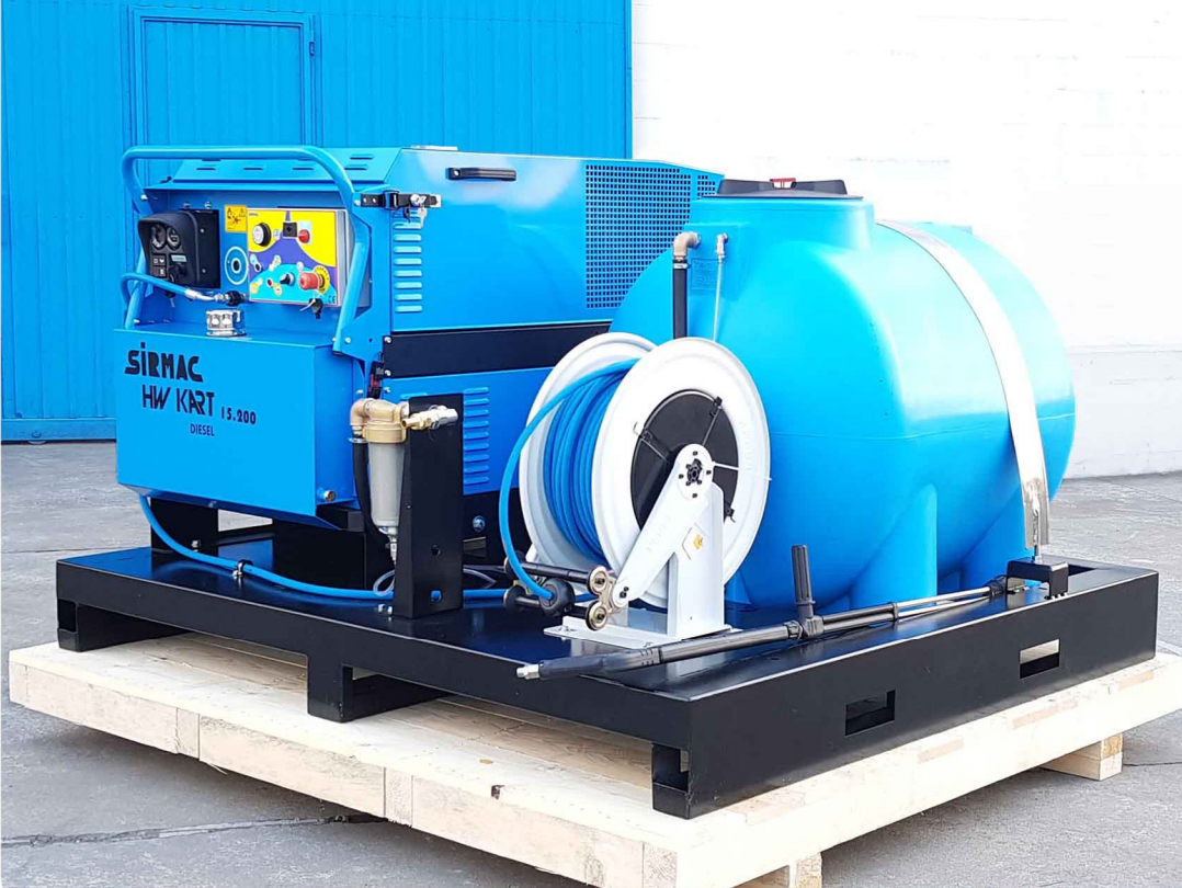
Special unit with pallet-like base, consisting of the independent high-pressure washer, a water tank, a large inlet water filter and automatic hose reel.