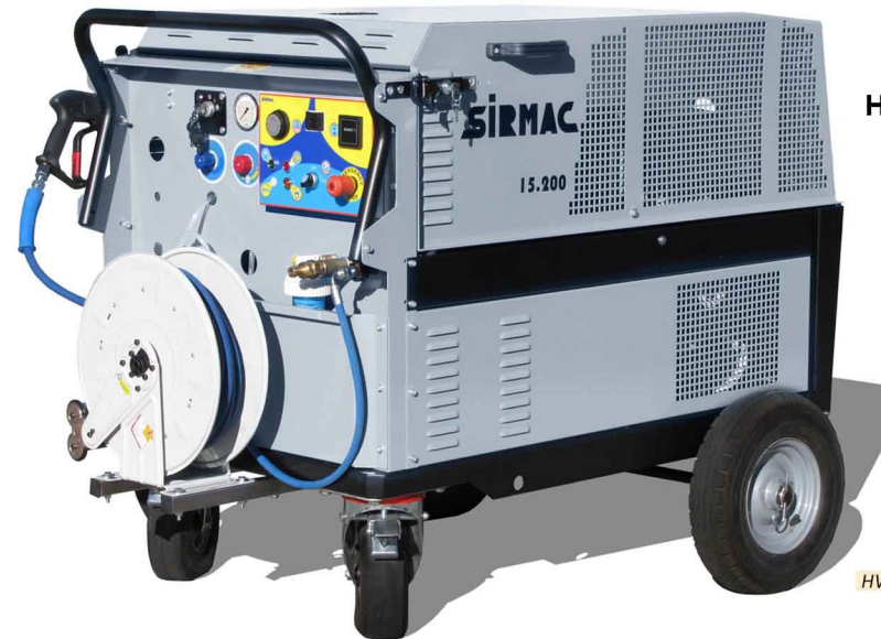
HW KART 15.200 with optionals